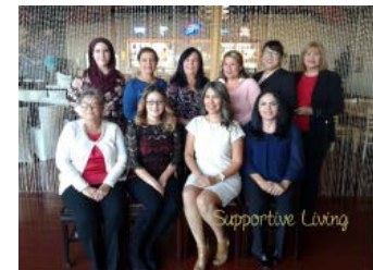
(Above) End of the year dinner.

**Safety News: We will be holding our Vehicle Inspection in January so be prepared to stop by the office.