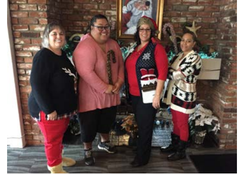
(Above) San Marcos management team