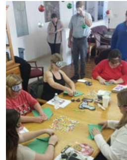
(Above) Staff Christmas party