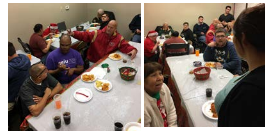
(Above) Clients at their Christmas party!