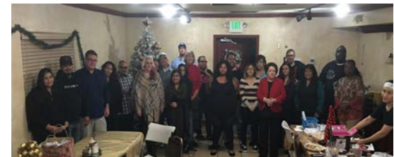
(Above) Visalia staff