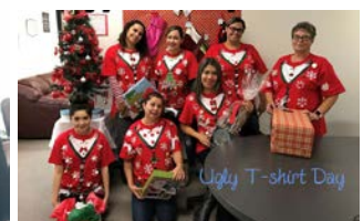
(Above) Staff wearing "ugly" holiday shirts