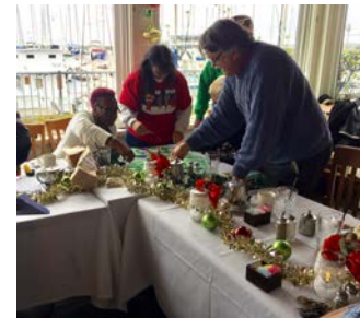
(Above) The winning team of the decorating contest