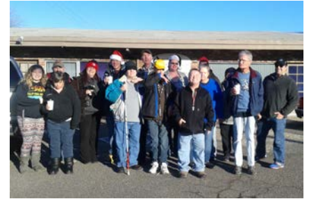
(Above) The Santa Stomp crew!