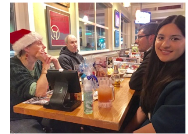
(Above) Holiday festivities at the Salinas office

Wishing everyone love, peace, and laughter for 2017! Cheers!