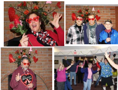
(Above) Staff and clients at the Valentine's Day party.