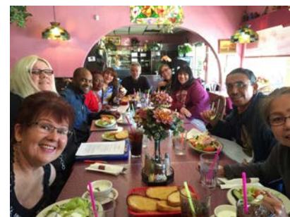
(Above) San Marcos staff