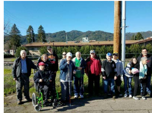
(Above) Ukiah clients