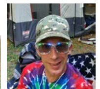
(Above) Ukiah office clients enjoying the park and some amazing birthday cake.