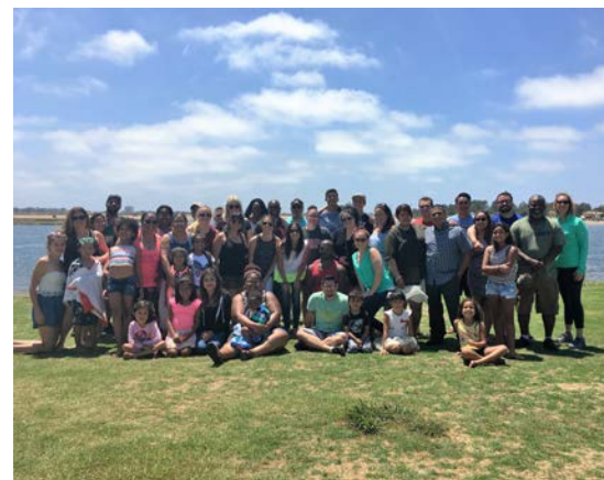
(Above) VCS staff at the bay