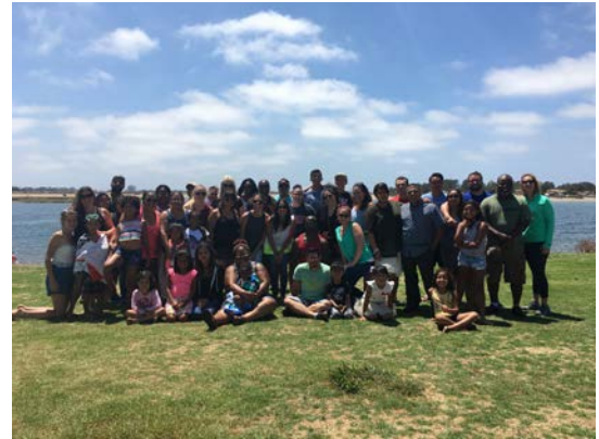
(Above) Staff at the bay