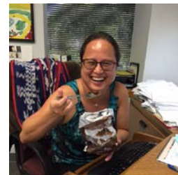
(Above) Pebbles with melted chocolate and a spoon.