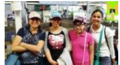
(Above) Mid-Winter Fair