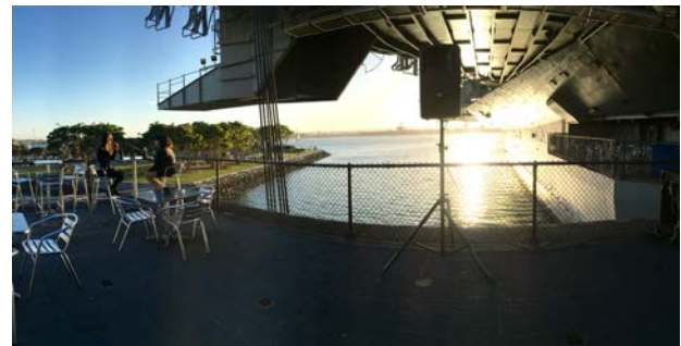
(Above) VCS staff near the USS Midway