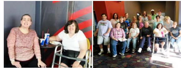
(Above) Benny Bowl Advisory Event