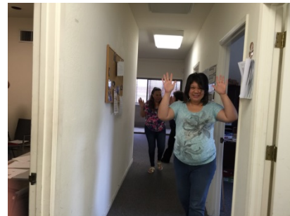
(Above) Staff during the active shooter drill.