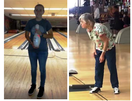
(Above) Bowling during the Advisory event.

The Mid-Winter Fair event for our clients was a HIT – they loved having the fair all to themselves. All clients from our area had the opportunity to ride attractions, play games and get their favorite carnival food. Thank you to all the DSA's who participated in this event and made this fun for everyone. •