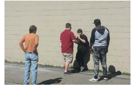
(Above) Staff participating in a Pro-Act class.

We hope everybody's year is going well so far! •