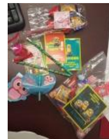
(Left) V-Day candy from the Candy Exchange.