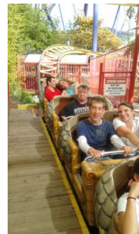
(Above) Six Flags Discovery Kingdom.