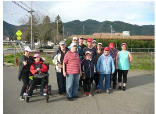
(Above) Cupid Shuffle & CAC Meeting with clients and staff.