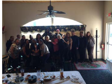
(Above) Group photo during Shelley's dinner