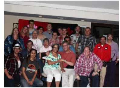
(Above) Valentine's Day Sadie Hawkins Dance.