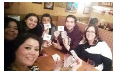
(Above) End of the year party at Famous Daves.