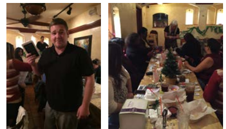
(Above) Visalia client Christmas party.