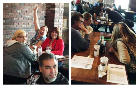
(Above) Southern California staff party

Safety: Do not forget that we have an updated Fire Drill – please make sure you have all our clients review the information.