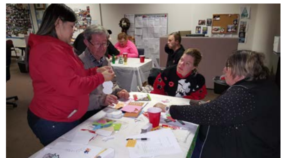
(Above, top to bottom) Clients and staff at the Santa Clara holiday party.