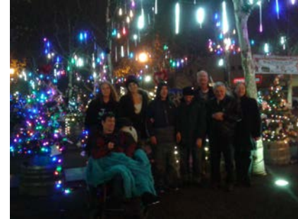
(Above) Charlie Brown Christmas Lights