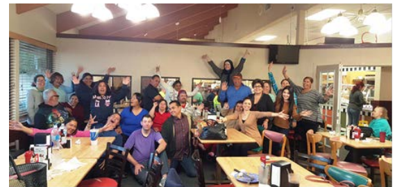
(Right) Advisory meeting at Golden Corral.